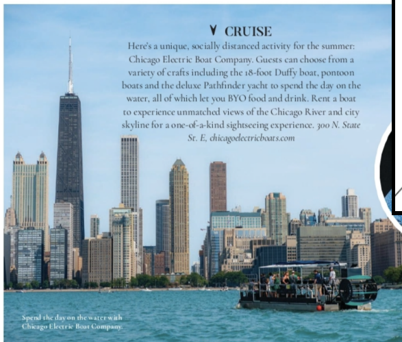
Spend the day on the water with Chicago Electric Boat Company.