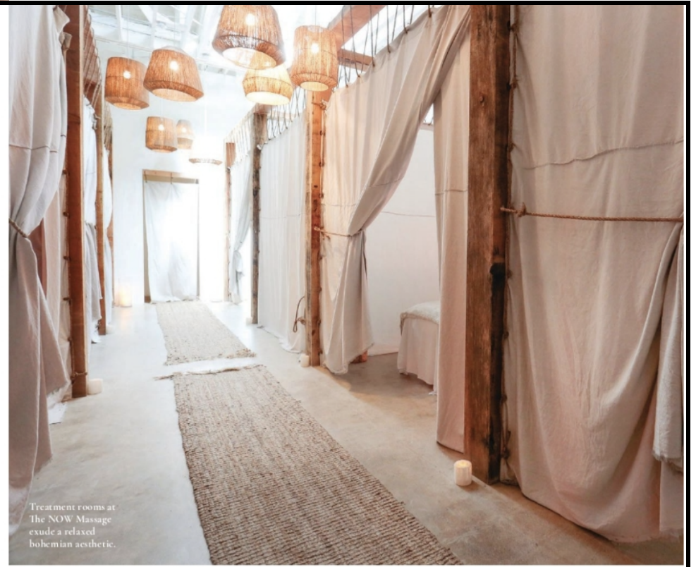
Treatment rooms at The NOW Massage exude a relaxed bohemian aesthetic.

Built to feel like an oasis for rest and relaxation, The NOW Massage is Chicago's new go-to destination for self-care. With over 80 locations across the country, this Los Angeles-based wellness massage boutique is opening its doors in Chicago to provide the perfect opportunity for clients to take a break and focus on stress relief and overall health improvement with Swedish-inspired massage techniques. Choose from three signature massage styles and pair with a variety of custom enhancements, such as herbal heat therapy; the Fresh Eyes soothing eye mask; and Hemp Calm Balm, a unique combination of cool peppermint and warm capsicum. 2038 N. Halsted St., 773.614.7971; 1109 S. Wabash Ave., 312.667.0960, thenowmassage.com